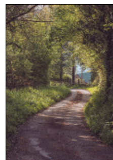
What funding is available to study at Black Mountains College?