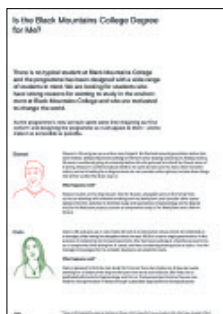
Is the BA (Hons) Sustainable Futures for me?