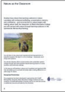
Nature as the classroom