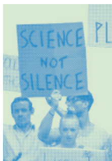
Essay: Education as if People and Planet Matter