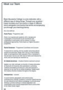
Meet our team