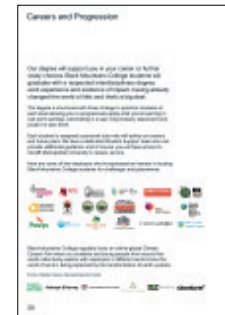
Careers and progression