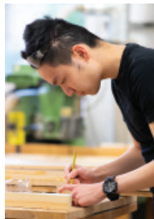
BA (Hons) Sustainable Futures: Arts, Ecology and Systems Change Curriculum