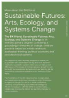
More about our BA (Hons) Sustainable Futures: Arts, Ecology and Systems Change