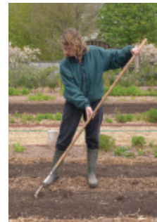
Why choose Black Mountains College?