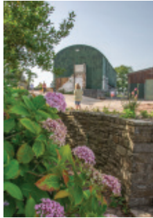
Where will I learn?